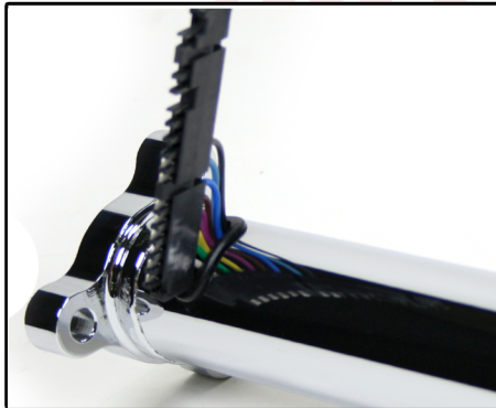
E-Z-Go Golf Cart 3-Bolt

For Part Number's 1129400020, 1129401020