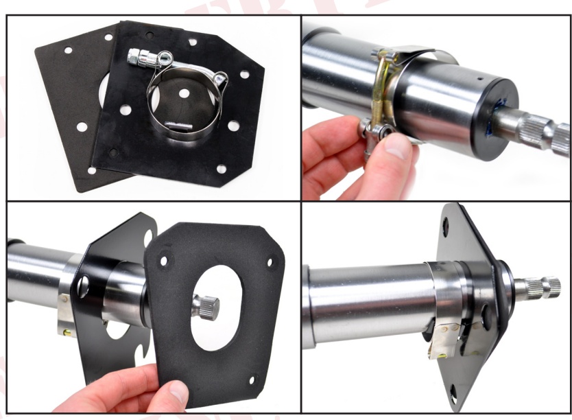
Images are representations only. The shape/size of the Corvette floor mount will differ.