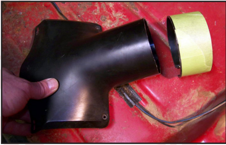
Cut Long Trim Piece