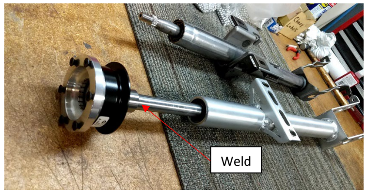
Figure 1: quick release steering hub shown on Ididit racing column.

and the Quick-Release Center should be installed in the Quick-Release Hub. Ensure that the Steering Wheel is centered in the "12 O'clock" position before welding the Quick-Release Center onto the Steering Shaft. Mark hub to shaft alignment and remove quick release center from hub. Place quick release center over column shaft and weld. Welding should be done by a trained professional.