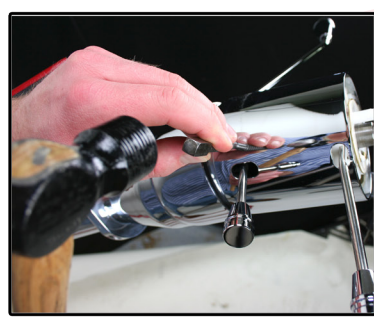
1. Before you begin your installation, make sure the column is tilting straight up and down.